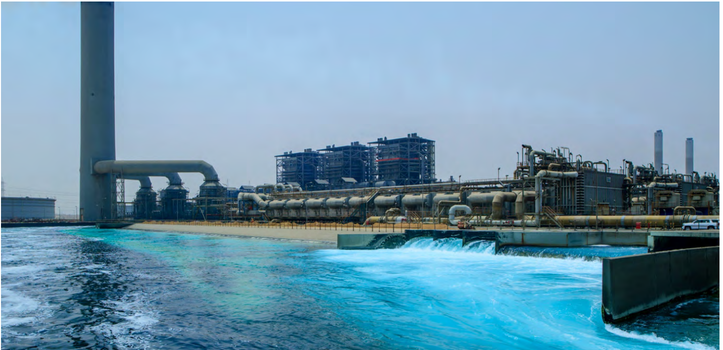
Jeddah 500 MLD ISTP- Saudi Water Partnership Company (SWPC)