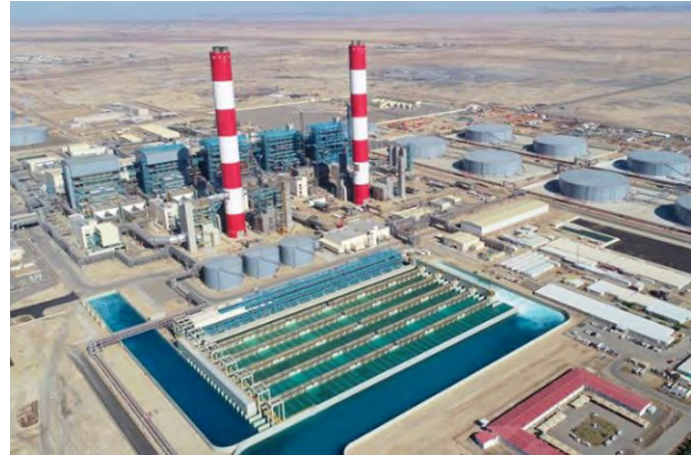
Yanbu III - Pumping Stations of Yanbu - Madinah Water Transmission System