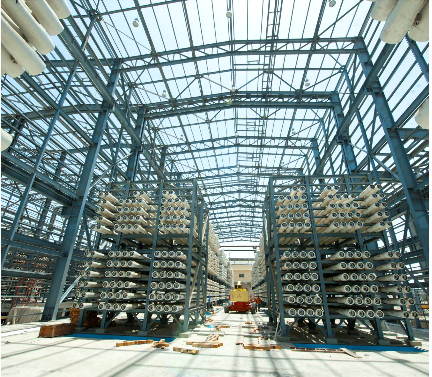
Jeddah Reverse Osmosis plant 240 MLD