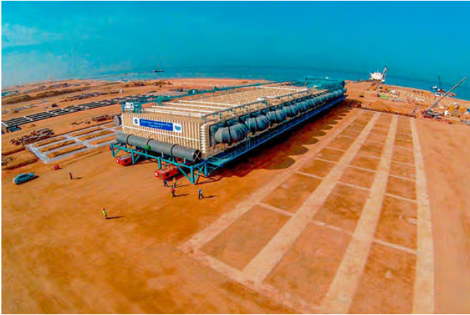
Yanbu Power & Desalination plant Phase 3 - 550 MLD